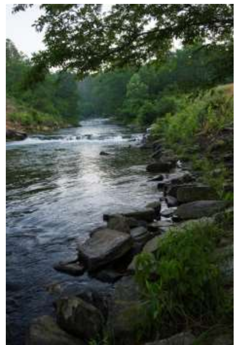
Floating and fishing are popular activities in eastern Oklahoma's streams

Oklahoma Forestry Services Department of Agriculture, Food and Forestry 2800 North Lincoln Boulevard Oklahoma City, OK 73105 405-522-6158 www.forestry.ok.gov